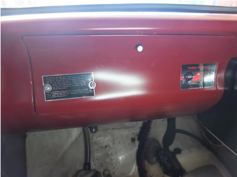
Ford Rallye Sprint original Lightweight Panels warranty exclusion and LSD Sticker