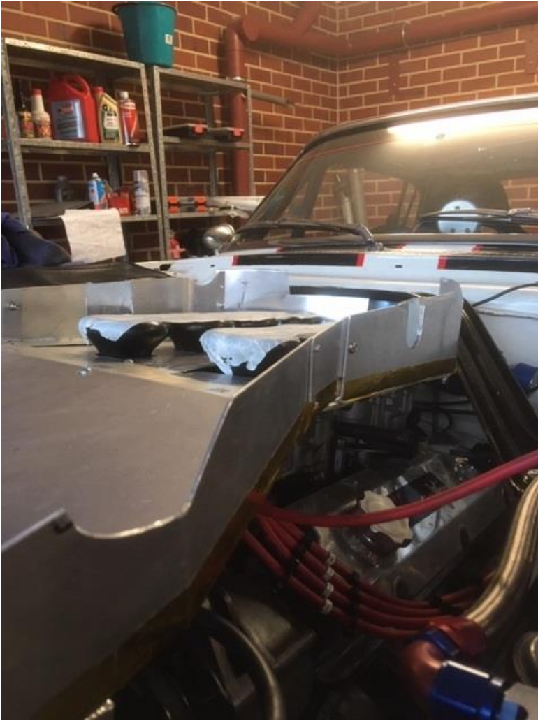
Falcon cold air tray and high performance webber trumpets