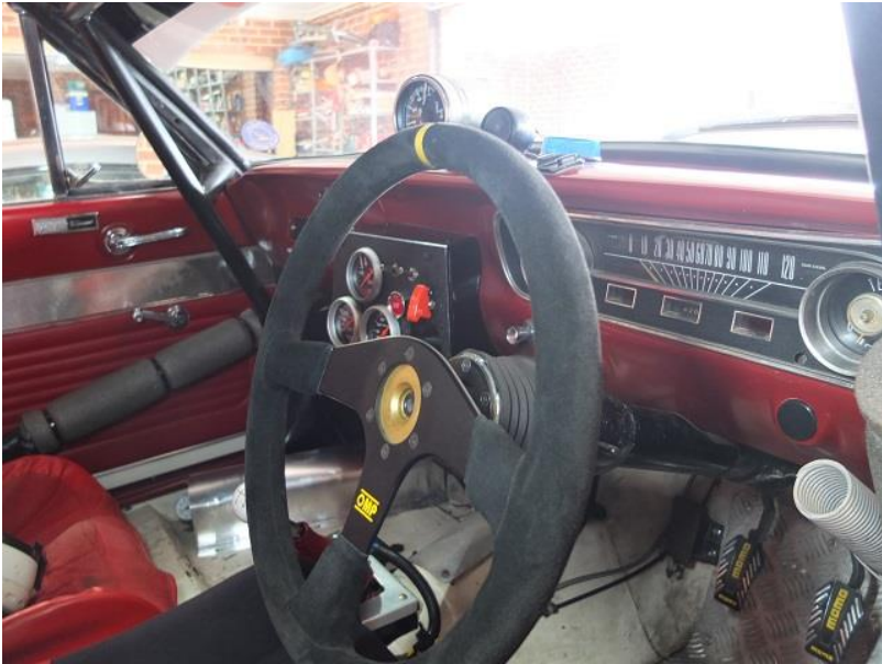
Dashtop Tacho, oil & temp warning strobe & siren